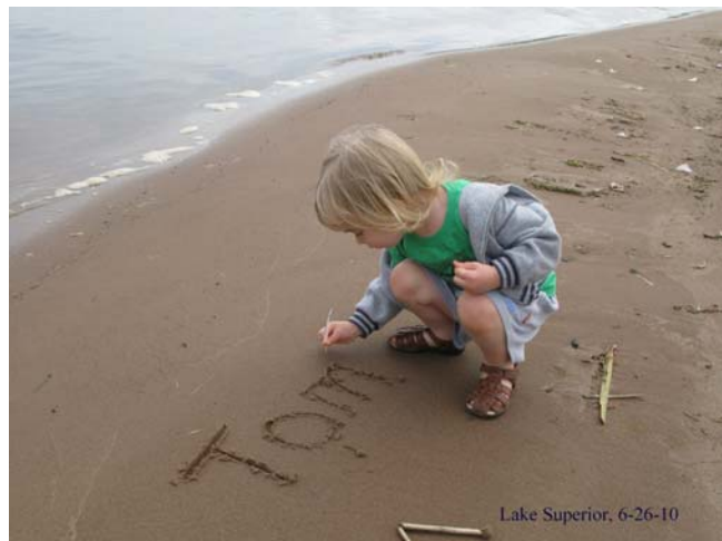
Lake Superior, 6-26-10

I hope you are enjoying the dog days of summer. I've had some great projects to work on. Incidentally, two solutions are very appropriate for combating the heat and glare of the sun. I'm making sheers on a beautiful decorative wood traverse rod for one client. And we'll block the glare of the sun for another client with a nubby neutral fabric pulling back on custom painted iron rods with rings.