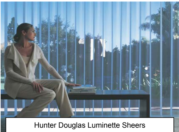
Hunter Douglas Luminette Sheers

Hunter Douglas begins their Sheer Genius Sale from June 1 – August 15, 2010.