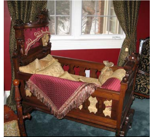
Antique crib - Traditional design

Using color as a starting point opens up an array of design possibilities. You can decide to be traditional with pinks or blues, or select contemporary color that is fresh, current and can play to a variety of themes. Stay away from a licensed cartoon or character as your theme; it can be overpowering and very limiting. Give yourself room for creativity and imagination to adapt and change as your child grows.