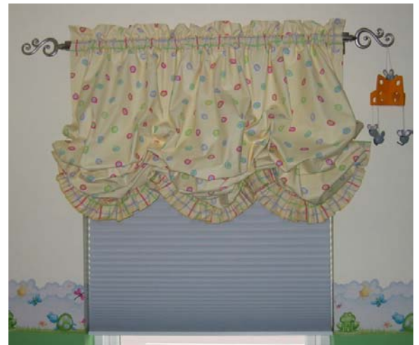
Hunter Douglas LiteRise TopDown BottomUp Duette

Cover outlets with safety plugs. Or better yet, replace the standard outlet with new safety outlets that don’t need those plastic covers.