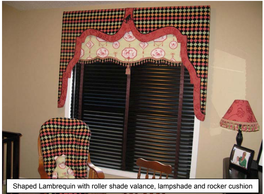
Shaped Lambrequin with roller shade valance, lampshade and rocker cushion

luscious salmon. For an unusual finishing touch to the window treatment, we chose a custom painted black metal monkey for the centerpiece of the lambrequin. I also made a little stuffed bear as a gift for Amelia.