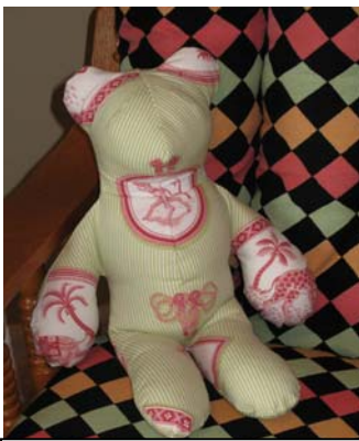
Circus print stuffed bear

We found a stunning diamond geometric with bold orange, salmon and green, anchored in basic black. We added a whimsical green circus animal print. And a bit of luxury with an embroidered flower design in a